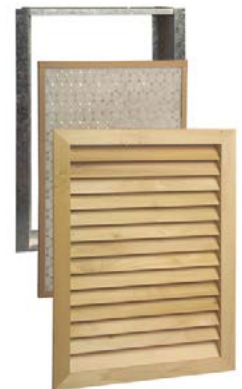
Baltic Birch Grille

Using a Worth Home Products' grille also makes economic sense. Our superior design and construction requires no special preparation to the grilles or modifications to standard return-air openings. And of course they are engineered to ensure proper air flow so HVAC systems can work effectively. Site-built grilles are no match.