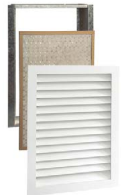
Primed Baltic Birch Grille